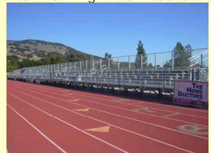
San Marin High Vistor Bleachers