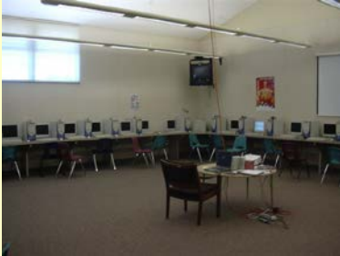
Hill Computer Lab