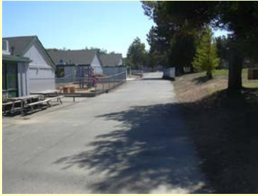
Hamilton Fire Lane

Site-by-site summary of the projects completed to date, as well as projects planned for the near future.