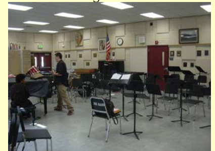
Novato High Music Room

State law mandates that bond funds be utilized to provide partial funding of the facility needs of our charter school. To date, the obligation has been met for Novato Charter School facility.