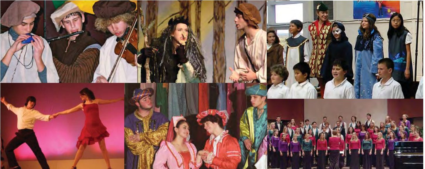
Students from Lynwood Elementary, San Marin HS and Novato HS demonstrate their visual and performing arts skills.